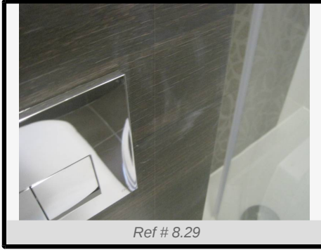
Ref # 8.29