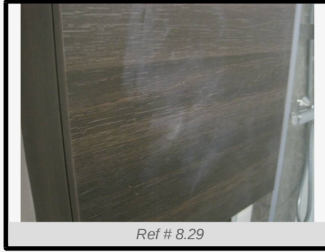
Ref # 8.29